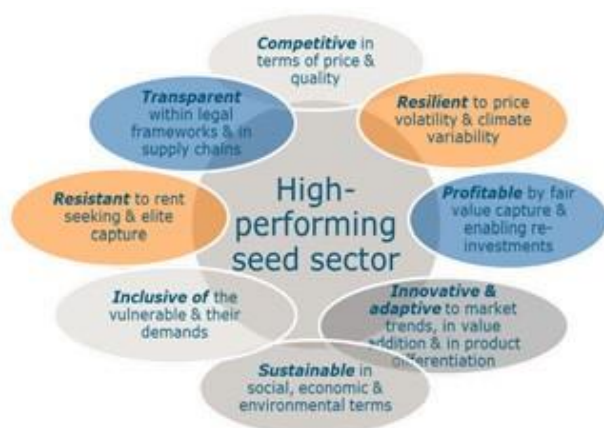
Figure 3 Seed sector vision

The vision for the seed sector in Nigeria is to become more competitive, resilient, profitable, innovative and adaptive, sustainable, inclusive, resistant and transparent. The vision is illustrated in Figure 3.